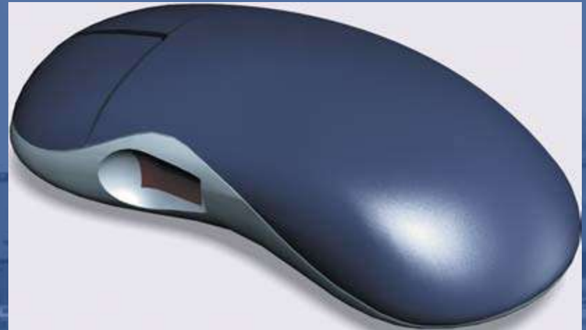
Mouse fingerprint reader